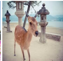
Deer at Miyajima