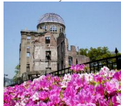
Hiroshima Bomb Dome