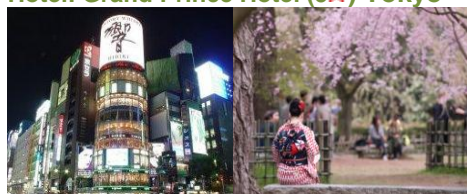
Ginza in Tokyo