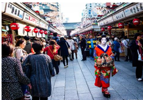
Asakusa Temple Tokyo