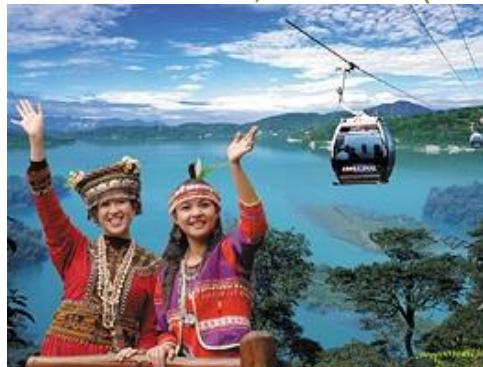
Sun Moon Lake

Day 16 (Thur) East Coast National Scenic Area / Taroko Hualien (B) EAST COAST NATIONAL SCENIC AREA known as "Taiwan's Last Unspoiled Land", stretched 170km down the east coast of the island. Weathering, erosion and accumulation have produced a wide range of landforms here. Visit SIAOYELIYOU , SANSIENTAI , STONE STEPS , CAVES OF EIGHT IMMORTALS . Overnight at the luxury 5 stars hotel inside the Taroko Gorge National Park. Hotel: Silks Place, Taroko (5★)