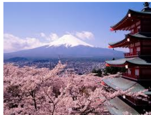
Mt Fuji at Cherry Blossom

Hotel: Palace Hot Spring Hotel (5★) Hakone