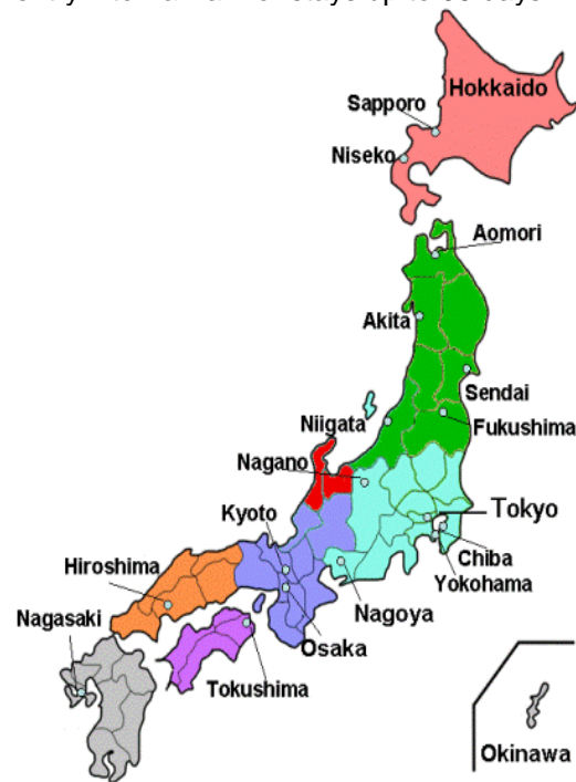
Map of Japan

Area: 36,000 square km Capital: Taipei City Population: 23 millions Language: Mandarin, Taiwanese, Hakka Time Differences: 2 behind Sydney Electricity: 110 volts (2 flat pins) Currency: New Taiwan Dollar (NT$) Entry Requirement: Passports must be valid min 6 months after travel. Visa not required for Australian passport holders to entry into Taiwan for stays up to 90 days.