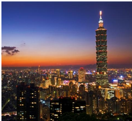
Taipei 101 at sunset

Day 18 (Sat) Arrive AUSTRALIA The flight will arrive Sydney at 11AM .