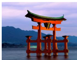
Tori Gate Hiroshima

Hotel: Hotel Granvia, Hirishoma (5★) or s