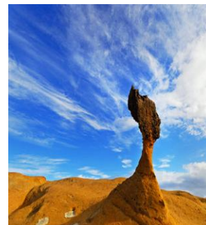
Queen's Head North Coast

Hotel: Fleur de Chine, Sun Moon Lake (5★)