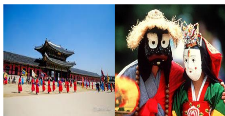
Gyeongbokgung Palace Korean Folk Village

Hotel: ibis Ambassador Seoul Insadong Hotel (3.5*) or similar