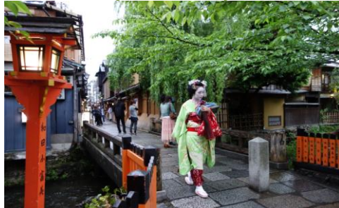
Historical city of Kyoto

Hotel: New Miyako Hotel, Kyoto or similar