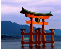
Tori Gate Hiroshima

Hotel: Hotel Granvia, Hirishoma (5★) or s