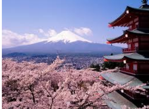
Mt Fuji at Cherry Blossom Time

Hotel: Palace Hot Spring Hotel or similar