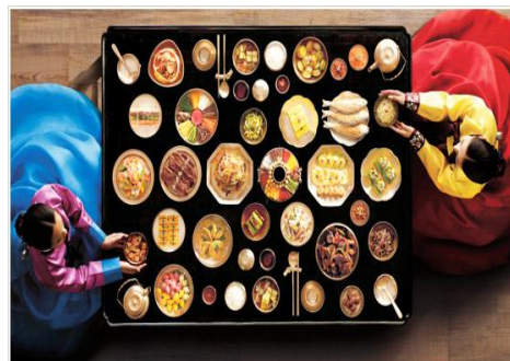
Traditional Korean Cuisine & Culture

Hotel: ibis Ambassador Seoul Insadong Hotel (3.5*) or similar